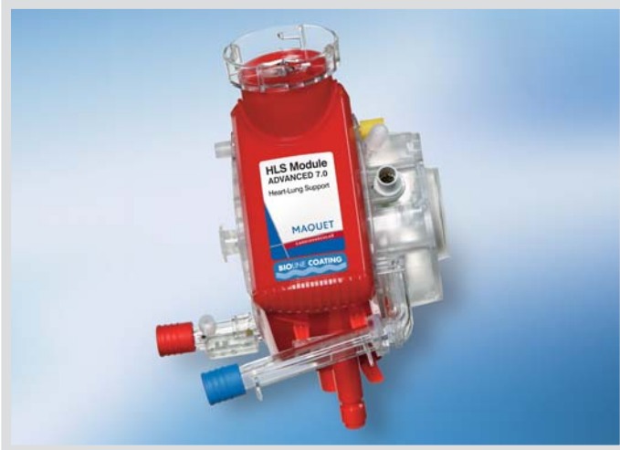
HLS Module Advanced 7.0