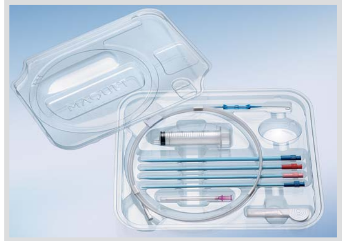
Percutaneous Insertion Kits

The HLS Cannulae from MAQUET constitute the access of the HLS System to the patient's blood vessels. These specially developed cannulae can be safely and gently inserted into the veins and arteries – either percutaneously or by surgically exposing the vessel. MAQUET HLS Cannulae are made of biocompatible polyurethane and, like all other blood-carrying components of the HLS System, are coated with BIOLINE Coating. Their thin walls ensure excellent flow with minimal pressure drop. In order to guarantee a high degree of flexibility and kink resistance particularly in long-term use, all the cannulae have been given wire reinforcement.